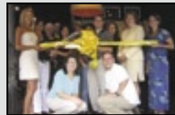
Salon Bella, LLC

Address: 111 Broadway, Suite 1 Homewood, AL 35209