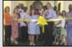
Executive Payroll Solutions

Address: 120 Summit Parkway, Suite 208 Birmingham, AL 35209