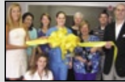
Hair of the Dog Pet Salon

Address: 111 Broadway, Suite 3 Homewood, AL 35209