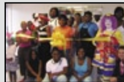
New Dimensions Hair Salon

Address: 813 Green Springs Hwy. Homewood, AL 35226